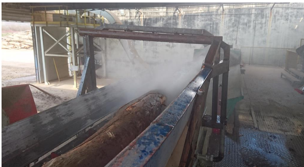
Figure 1 Log washing system before chipper

EkoStep installed a log washing system in February 2018 (see figure 1) and improved log selection. A second Audit and sampling was done on 16.3.2018 to check the improvements and take a new sample.